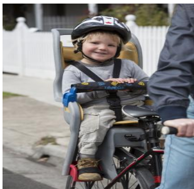
Child in a bike seat and wearing a helmet